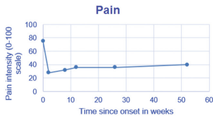
Figure 1. Time course of pain.